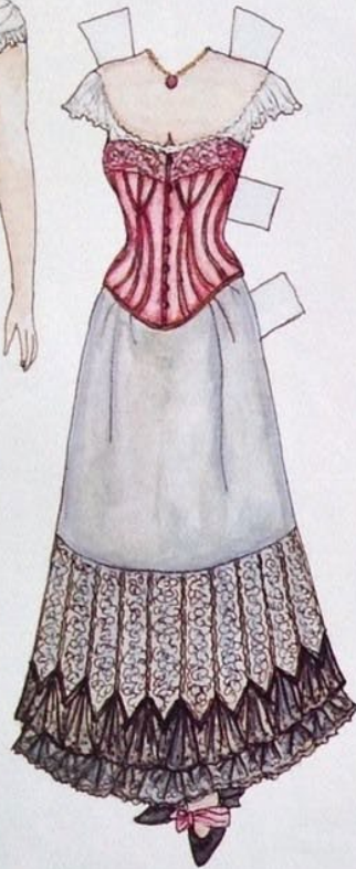
Corset & Petticoat