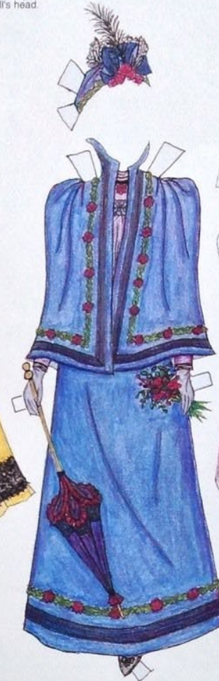
Day Dress With Cape

Carefully cut along dotted line. Slip hat over doll's head.